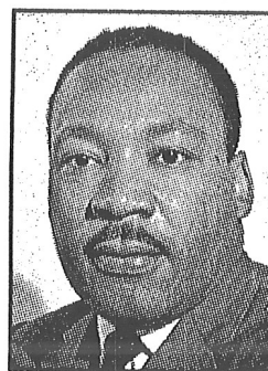
Martin Luther King